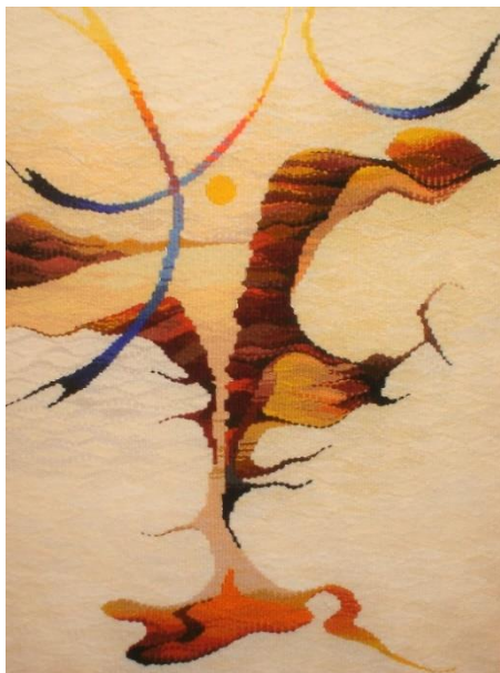
Namibian Desert